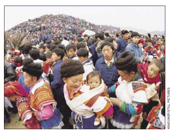
Social support after childbirth is linked with low rates of postpartum depression

We have provided some examples at different levels of the pathway to care and prevention of mental illness where the developed world could learn from the developing world. High income countries considering such developments would have to make them fit for purpose in a different social and economic environment. The issue of sustainability also arises. Community based support after childbirth has a long history, and medical ward care for psychiatric emergencies in Jamaica has been used for 30 years, but